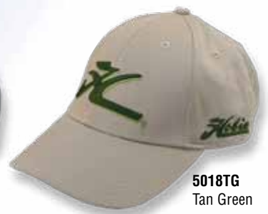
5018TG Tan Green

HOBIE HATS Hats with Hobie "H" in contrasting color and "Hobie" on the side. Mesh versions are breathable and made from 100% Polyester. Others are 100% Cotton Brushed Twill. All but Blue/Gold have embroidered logo raised and back shadowed.