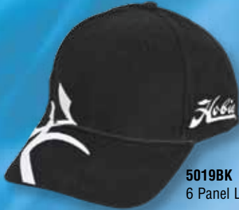
5019BK 6 Panel Low Pro