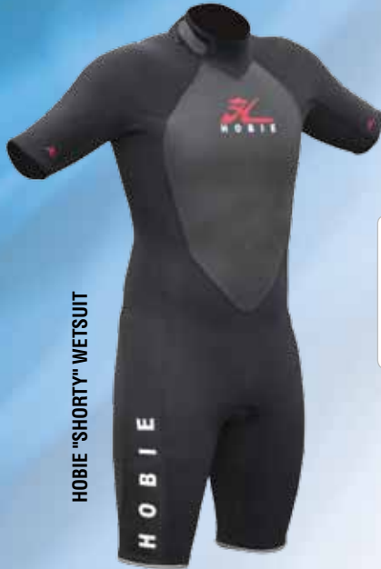
HOBIE "SHORTY" WETSUIT