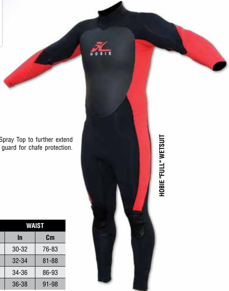
HOBIE "FULL" WETSUIT

CONSTRUCTION: 100% Dura Flex with mesh chest and back panels, Glued, Blindstitched seams.