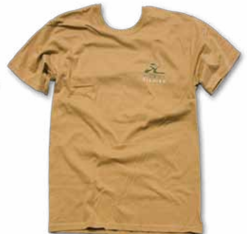
5131xx Hobie Mirage Fishing (Tan)