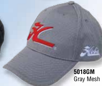
5018GM Gray Mesh