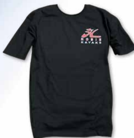
5129XX Hobie Mirage Kayaking (Black)