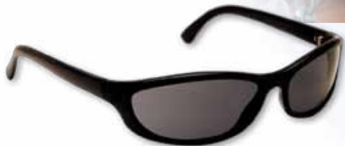
PLAYA - 1562BLK