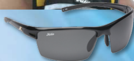
Boomer - 1564BLK