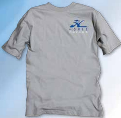
5130xx Hobie Mirage Kayaking (Gray)